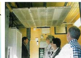
Passive Cooling Cells / Containers Filled with PCM Solutions